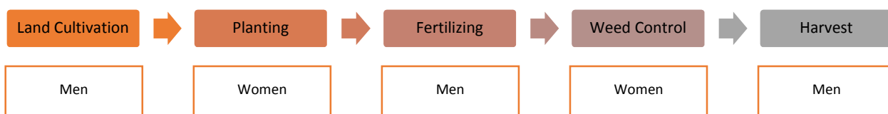
Figure 3 - Paddy Cultivation Stages and Division of Labour between Men and Women

Regarding their daily time allocation on a normal day, the interviewees explained that men would get up at 05 a.m., tend to the animals and then depart for the field. Women would start their day usually earlier, at 4 AM preparing the morning and mid-day meals which will be consumed at the field around 7 a.m. and 12. Women will return home around 2 pm, for having a short rest and by 3-4 pm re-attend to the afternoon household chores: buying food